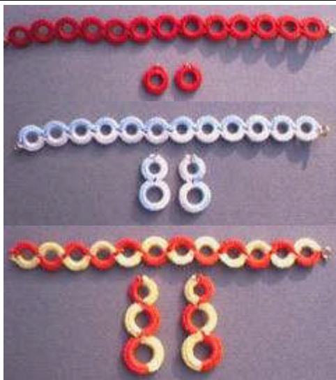
Summer Bracelet/Earring Jacket Sets