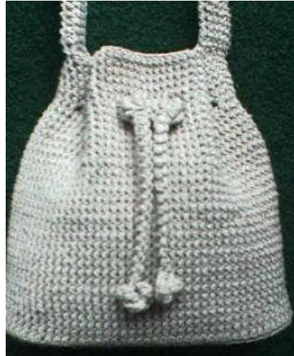
Bolo-Slide Shoulder Bag