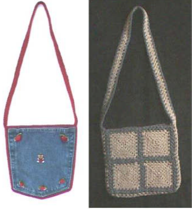
Funky "Pocket-Book" & Khaki and Denim Patchwork Purse