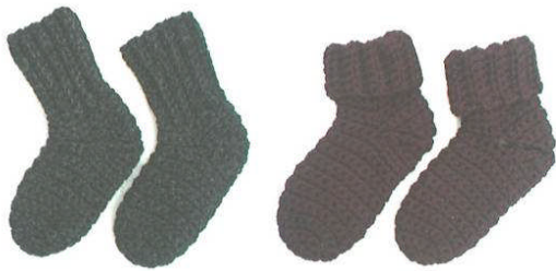
Men's & Women's House Socks