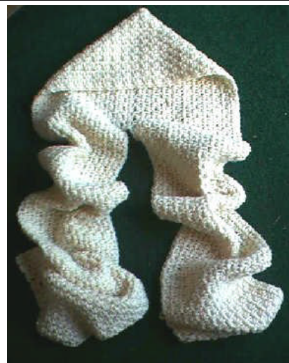
Adult Size Hooded Scarf