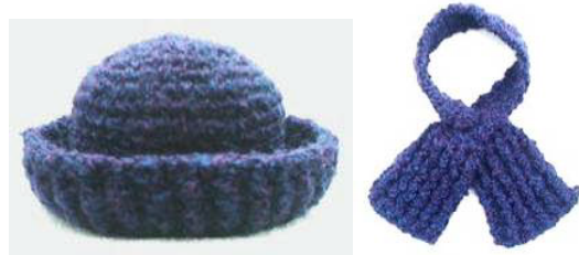
Dressy Boucle Hat and Scarf