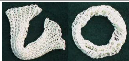
Light & Airy Tube Scarf