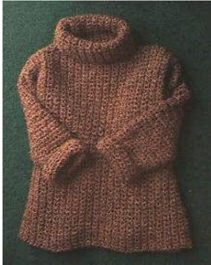
Women's Turtleneck Tunic Seamless Sweater