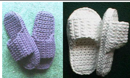
Men's & Women's Shower Scuffs