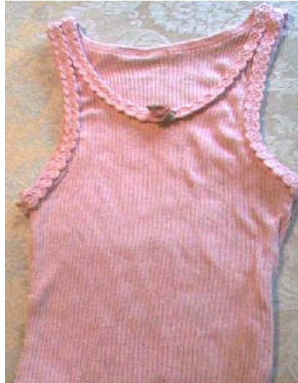
Double-Shell Edging-in-the-Round Tanktop