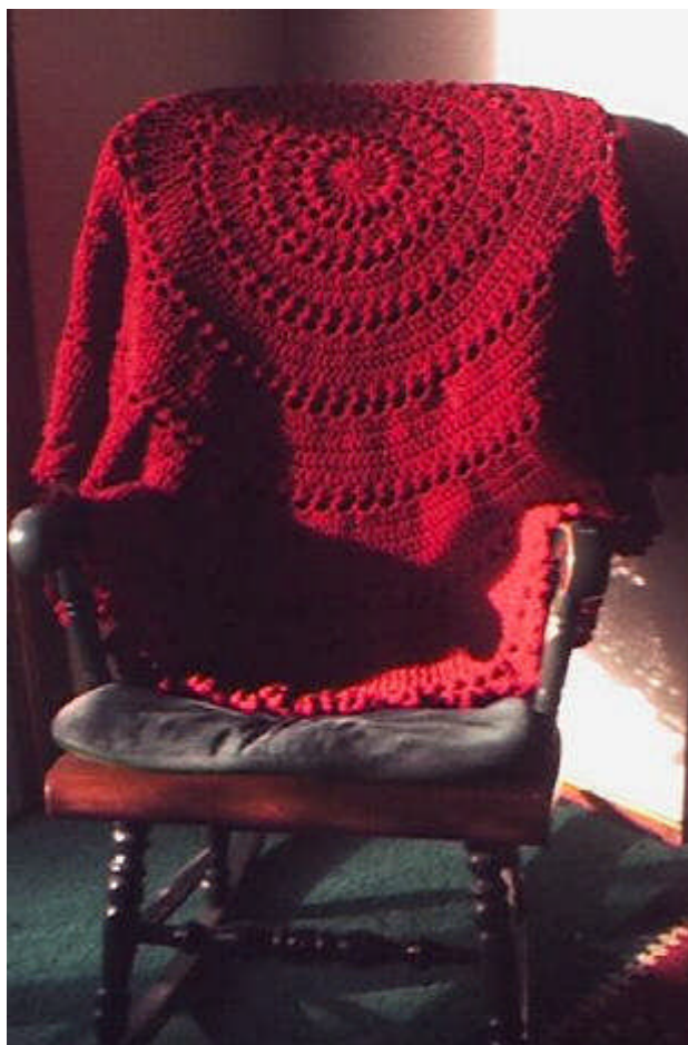
Skipping Stones Circular Afghan by Priscilla Hewitt ©2000